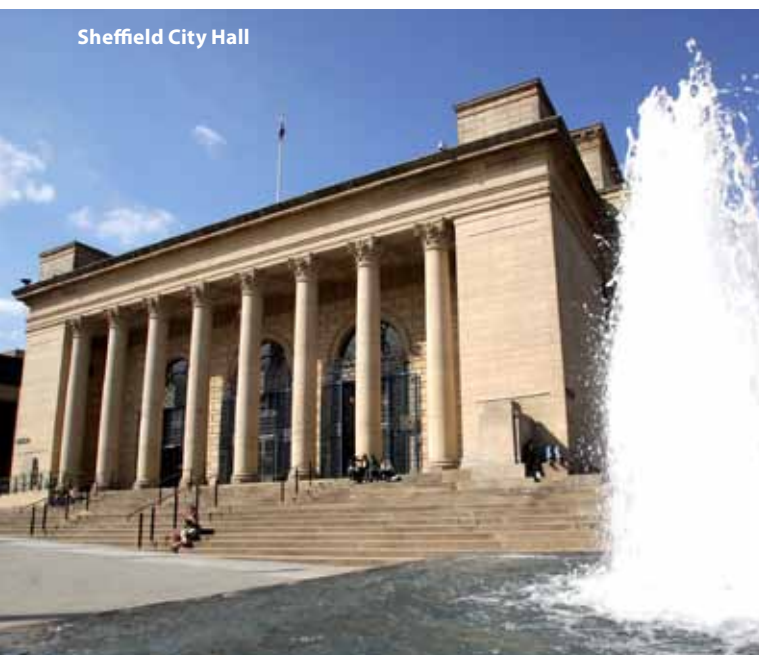
Sheffield City Hall

The four goals are summarised in the figure below, alongside the need to keep people and goods moving effectively, which derives directly from our vision.