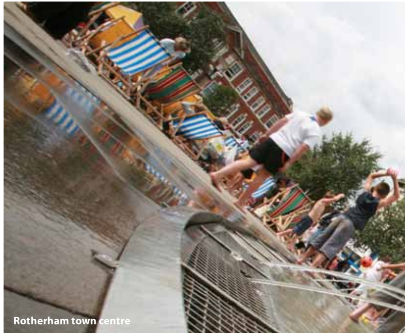
Rotherham town centre

This Transport Strategy has been developed jointly by the SCR partners. The strategy defines our priorities for our transport system, to be implemented over the next 15 years. It forms part of the Local Transport Plan for South Yorkshire, but it covers the wider SCR, which functions as a coherent economic area, with a transport system that also serves people from Chesterfield, Worksop, the Peak District and their vicinity. Formally, this strategy will influence spending priorities in South Yorkshire only, as the other counties are also developing their own transport strategies, but we are working in partnership so that this strategy is shared by all SCR districts.